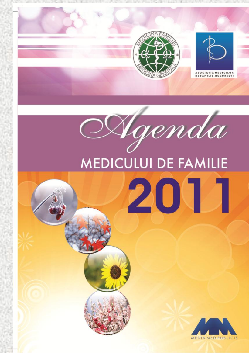
Annual Handbook (Agenda) for GPs