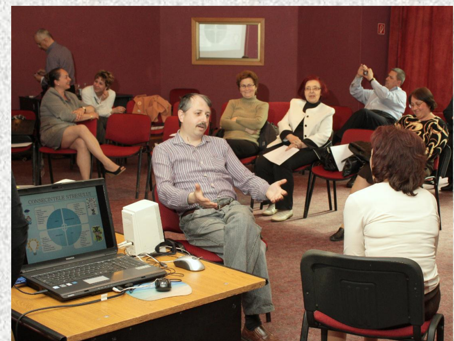
Workshop, May 2011