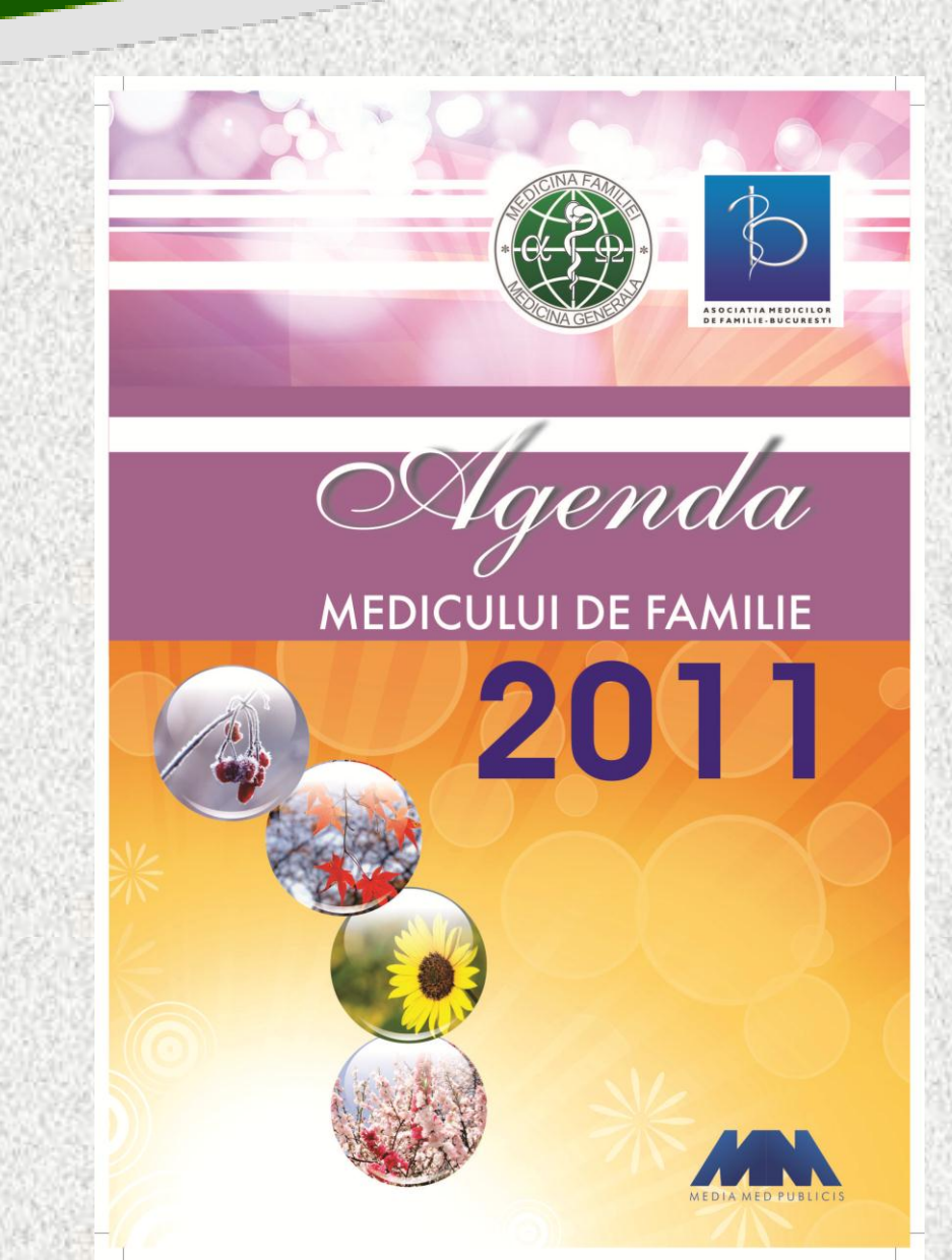
Annual Handbook (Agenda) for GPs